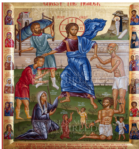
CHRIST THE HEALER